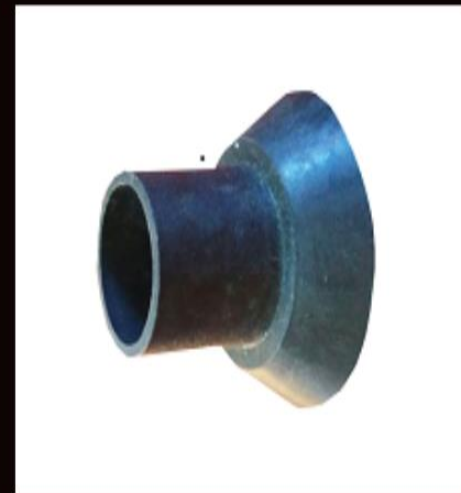
PVC CONE FOR TIE ROD