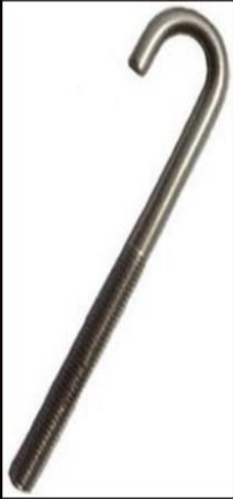
"J" TYPE FOUNDATION BOLT