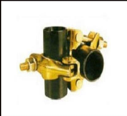
FIXED COUPLER RIGHT ANGLE