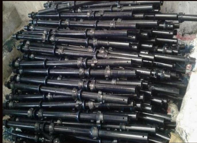
CUP LOCK SYSTEM