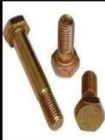
Hex Bolt Galvanized