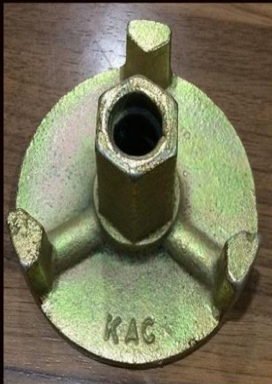
ANCHOR NUT WITH 3 LEG HEAVY