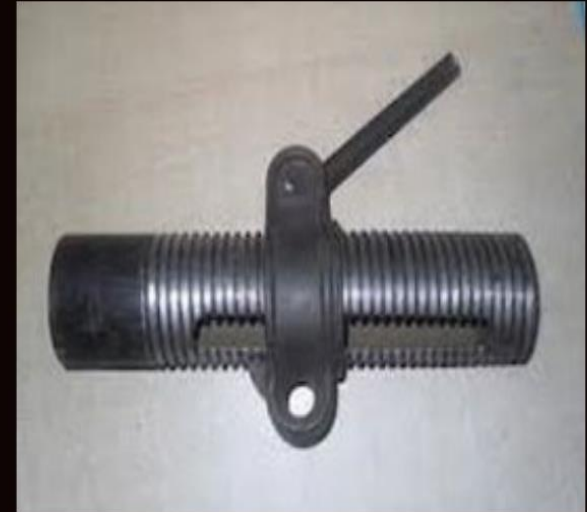
PROP SLEEVE WITH PROP NUT