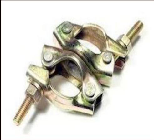
SWIVEL COUPLER ROTATE 360 DEGREE BS 1139 STD