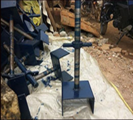
STIRRUP "U" HEAD