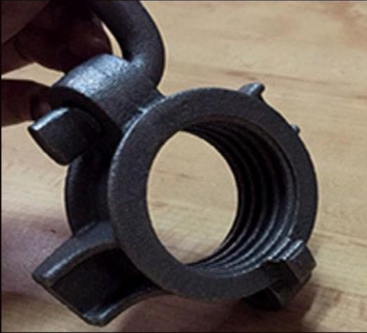
PROP NUT L & T TYPE