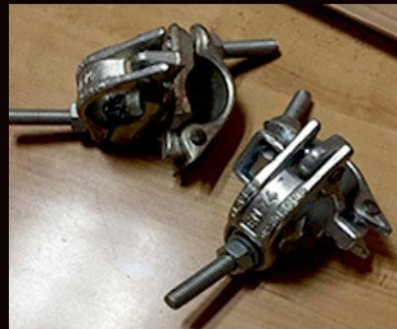
FORGED COUPLER ROTATE AND FIXED EN -74