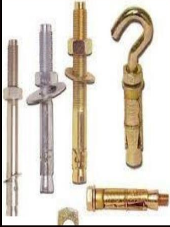
WEDGE, HOOK, BOLT TYPE ANCHOR FASTENERS