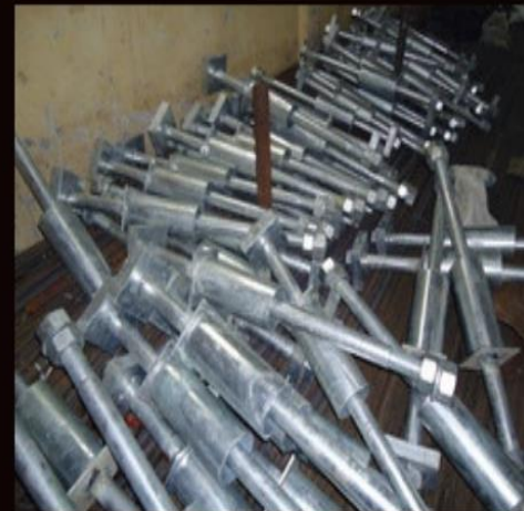
HOT DIP GALVANIZED FOUNDATION BOLTS