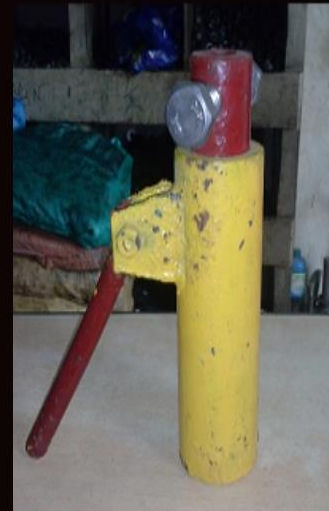
GO GO MACHINE