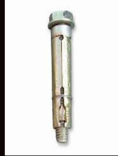
TUPE TYPE ANCHOR FASTENERS