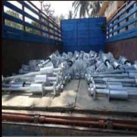
FOUNDATION BOLT WITH PIPE HDGI