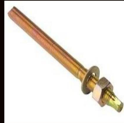
CHEMICAL ANCHOR ROD