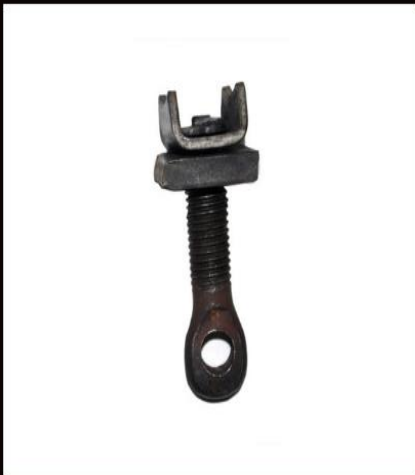
U CLAMP ASSEMBLY