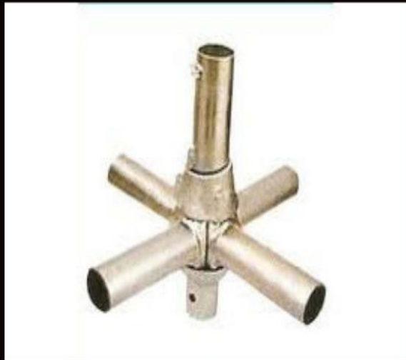
CUP LOCK ASSEMBLY