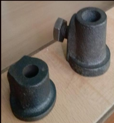
GO GO CLAMP