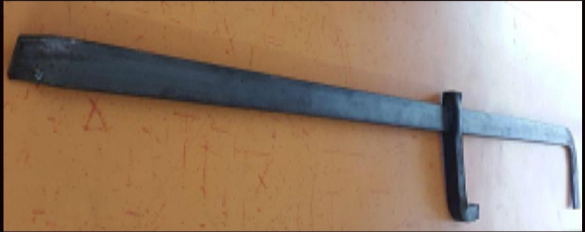
SHUTTERING CLAMP ( SICKANJ)