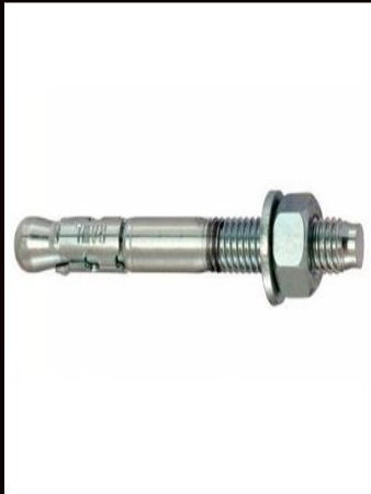
WEDGE ANCHOR FASTENERS SUITABLE FOR CONCRETE, RCC WALL