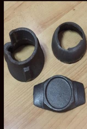
TOP CUP, LEDGER, BOTTOM CUP