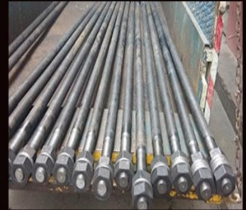
SAG ROD FOR STRUCTURAL