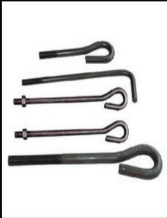
FOUNDATION BOLTS L, EYE, T, TYPES